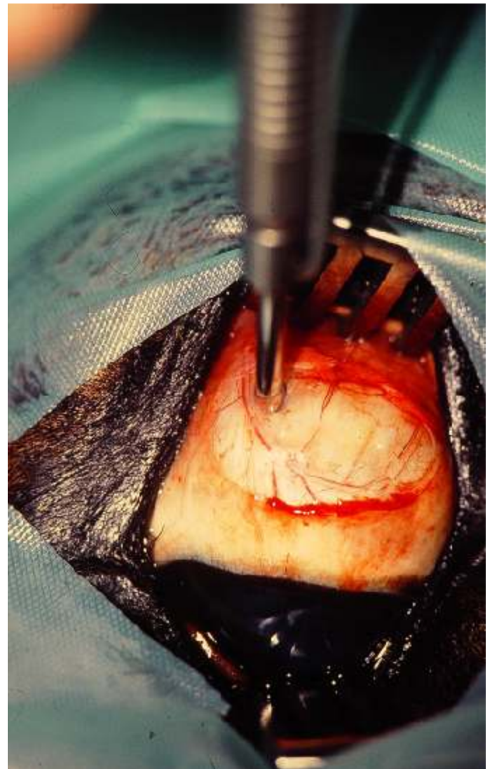
Figure 4: Incision for entering the pars plane vitrectomy

Two patients were vitrectomised with glaucoma. Glaucoma with the horse is generally a secondary glaucoma after uveitis. However, uveitis leading to a glaucoma should be distinguished from ERU. In advanced stages of the disease, the differentiation is easier, as the eyeball gradually becomes bigger with glaucoma in contrast to eyes affected by ERU. In addition, ligament cloudiness and temporary or permanent corneal oedemas are evident.