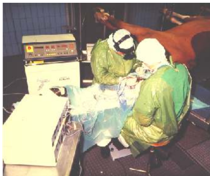
Figure 2: General view at the vitrectomy

The recurrent inflammation of the eye should be prevented, for the most part, through the surgical exchange of vitreous humour. A normal visual acuity and normal sight are strived for as the optimum objective.