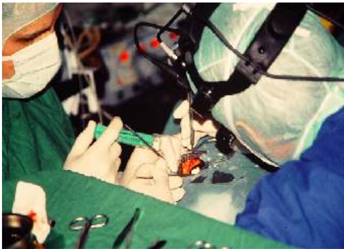
Figure 3: Situation during vitrectomy surgery

Mild uveitis attacks and a superficial keratitis occurred in 11 cases (2.6%). A retinal detachment occurred in 3 cases (0.7%). Surprisingly, only 2 eyes (0.4 %) were blind as a result of a secondary cataract.